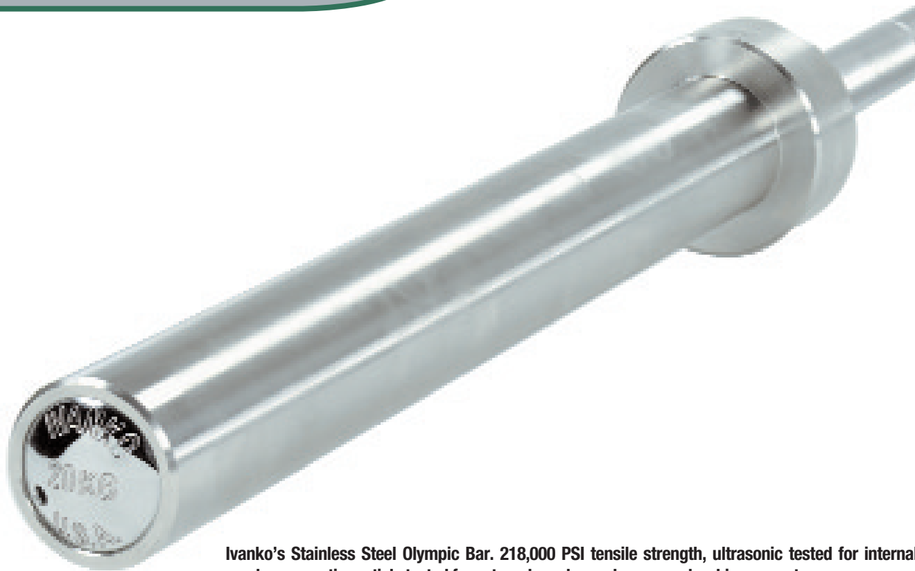
Ivanko's Stainless Steel Olympic Bar. 218,000 PSI tensile strength, ultrasonic tested for internal cracks, magnetic particle tested for external cracks, and never peels, chips, or rusts.

consequences. They are perhaps the most stupid and dangerous practice among Olympic bar manufacturers. This method involves completely knurling the bar, then coming back afterwards and making hand spacing marks by cutting off the knurling and cutting grooves into the bar! They probably think it looks nice, but the grooves reduce the diameter at that point, and consequently the strength of the bar. Over the years I've seen dozens of bars snap off at these weak points.