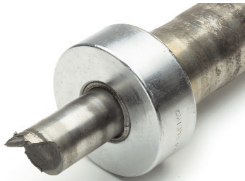
A typical bar failure (snap). Note jagged edge. This is usually the way they break.

Consequently, we made the decision to discontinue chrome plating Olympic bars for commercial use. In view of this learning experience, to do otherwise would be negligent.